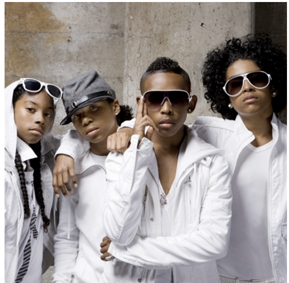
Ray Ray, Roc Royal, Prodigy, and Princeton.

Mindless Behavior stir up a frenzy wherever they go. Their style is a mix of R&B grooves, pop hooks, and hip-hop swag. What’s next for this boy-band super group? All the girls want to know the answer to that questions. People are always asking me who I think looks the best and of course I always say PRINCETON!