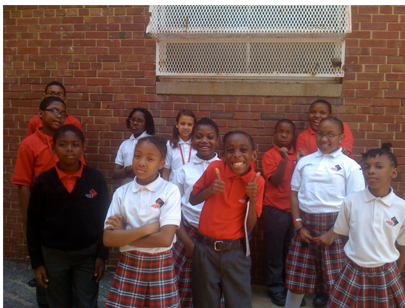
Carleton Advisory (5th grade)

Okay, well you heard it here first! The Ball will probably be off the chain. Until the Ball comes have fun and most important....MAKE SURE YOU GET IN!