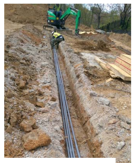
April 23, 2015 Underground Electrical Rough-In